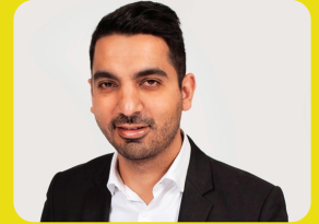
Waseem Carrim (CEO)

government only. More efforts are needed to avoid a major catastrophe to the socio-economic condition of our country. For the NYDA Board, the road ahead requires more investment in the youth who are not just the future of this country, but the present.